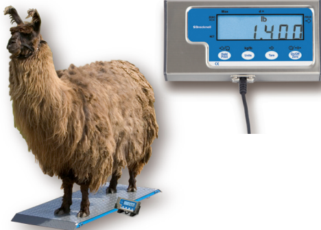
PS1000 shown with optional indicator stand