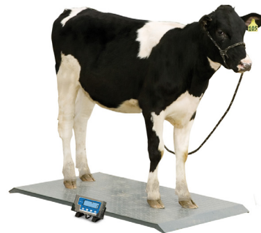
PS2000 shown with optional indicator stand