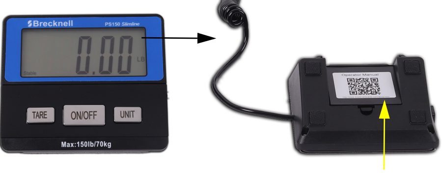
Battery compartment door

The Digital Receiving Scale operates with (4) "AA" batteries (Alkaline preferred). The battery compartment is located on the underside of the indicator portion of the scale.