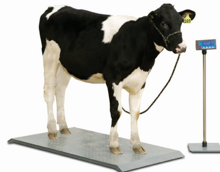
PS2000 shown with optional indicator stand