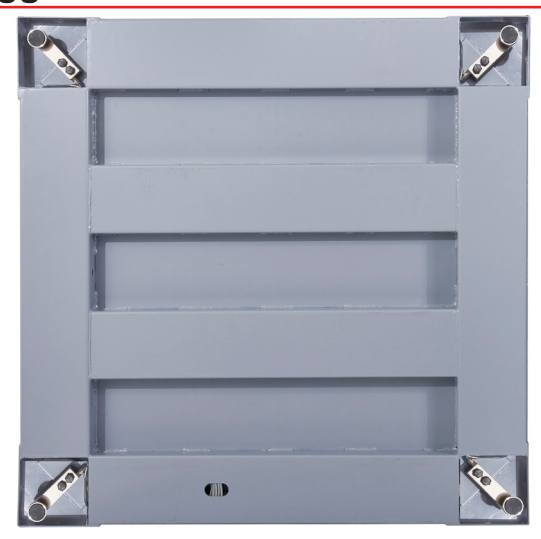
Wide channel design for superior durability

Warranty: Includes three year parts on DCSB deck from time of purchase. Consult factory.