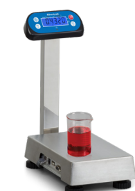
6702U shown with optional tower 152 mm x 254 mm / 6" x 10"