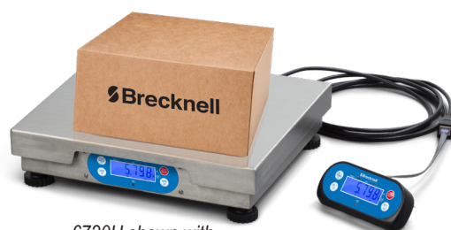
6720U shown with internal display and optional external display and 2 m extension cable 305 mm x 355 mm / 12" x 14"

The Brecknell 6700U Series is a versatile, multifunctional scale ideal for food-safe applications (NSF-certified design) and trade-approved weighing.