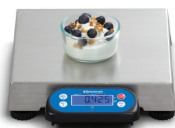
6710U shown with optional bracket 254 mm x 254 mm / 10" x 10"