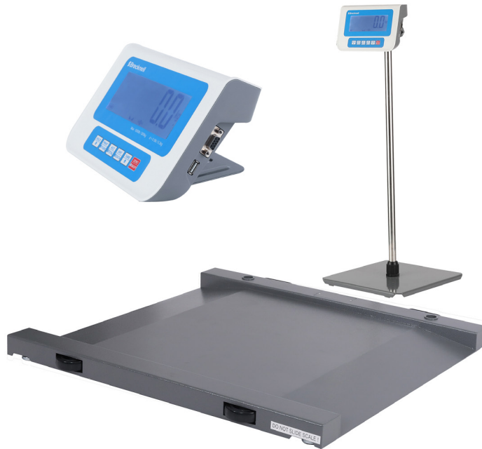
Shown with optional indicator stand

DS1000-LCD Drum Weigher Scale is ideal for any busy shipping area where goods are constantly being moved around by pallet trucks or monitoring drum weights.