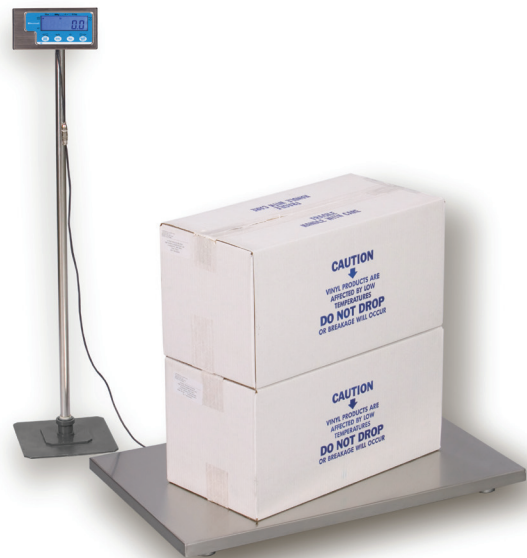
Shown with optional indicator stand and WS300-90 with rubber mat