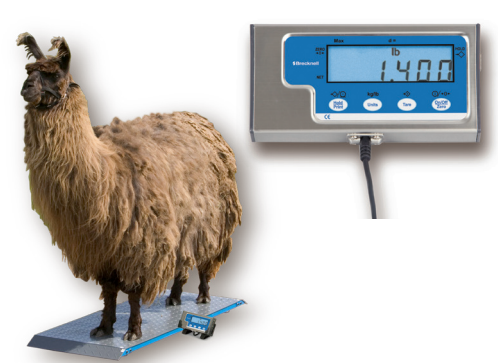
PS1000 shown with optional indicator stand