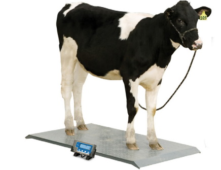
PS2000 shown with optional indicator stand