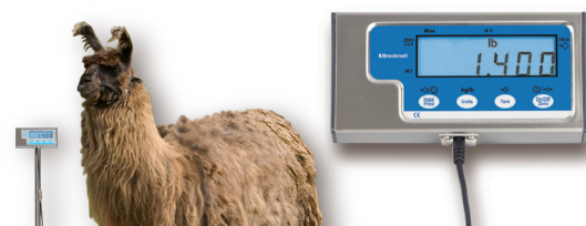
PS1000 shown with optional indicator stand