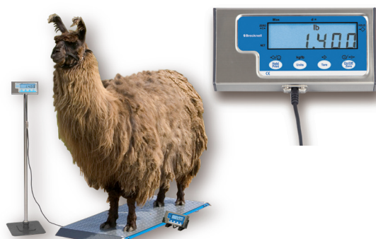
PS1000 shown with optional indicator stand