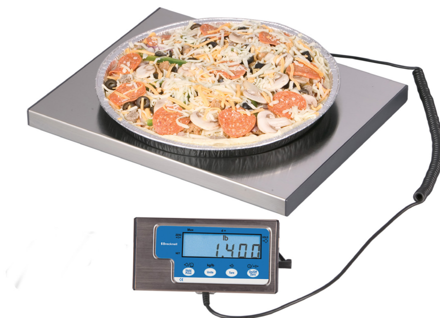
WS15 for use in portion control applications

Certifications: FCC compliant, Prop 65, UL/CUL power adapter, UKCA, CE, RoHS 3, WEEE