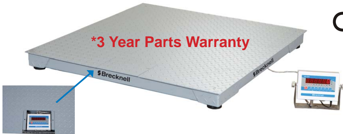
Convenient indicator storage for shipping