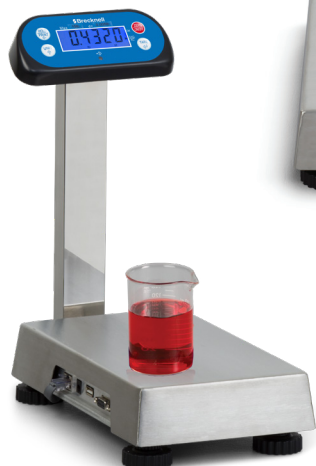
6702U shown with optional tower 6" x 10"