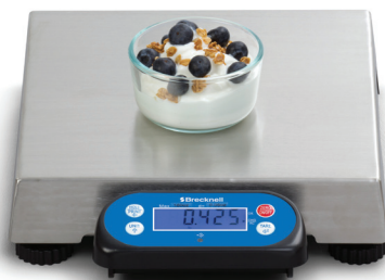
6710U shown with optional bracket 10" x 10"