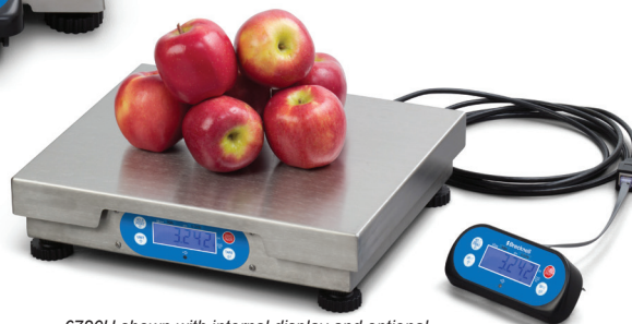
6720U shown with internal display and optional external display and 7' extension cable 12" x 14"

This NSF approved scale ensures that the product and facility where the product is made meets NSF standards for food safety. It has gone through extension testing to meet strict standards for public health protection. These capabilities are not found in many entry level kitchen/catering scales while also offering lasting performance.