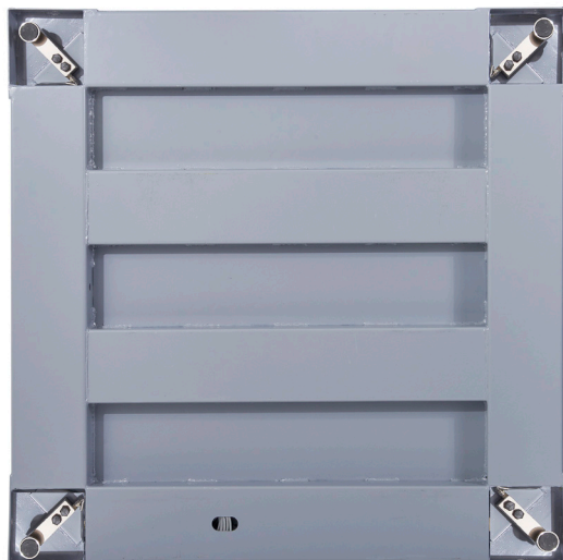
Wide channel design for superior durability

Warranty: Includes three year parts on DCSB deck from time of purchase. Consult factory.