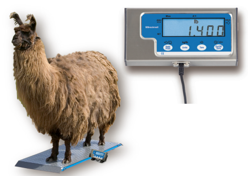
PS1000 shown with optional indicator stand