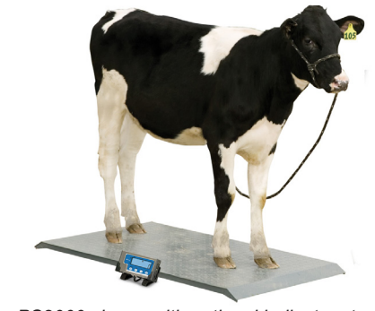
PS2000 shown with optional indicator stand

PS1000 Rubber Mat Kit : 816965007073 PS2000 Rubber Mat Kit : 816965007080