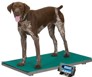
Shown with optional indicator stand and PS500-36 with rubber mat

Indicator Floor Stand (L x W x H): 13.8" x 13.8" x 1" 350 mm x 350 mm x 25 mm