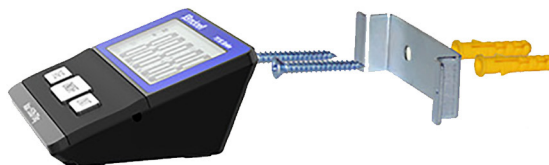
Wall mounting accessories (included)