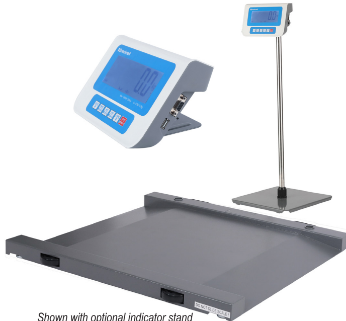
Shown with optional indicator stand

DS1000-LCD Drum Weigher Scale is ideal for any busy shipping area where goods are constantly being moved around by pallet jacks or for monitoring drum weights.