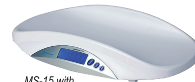
MS-15 with removable top plate

MS20 Series: Comes with a plastic or a stainless steel weighing tray. The weight hold function freezes and stores the displayed weight.